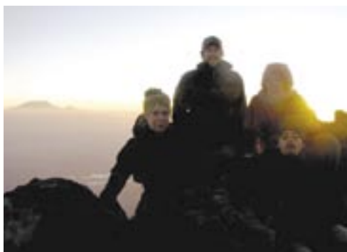
On top of Mt. Meru at dawn with friends and Mt. Kilimanjaro in the background (Christmas holiday)