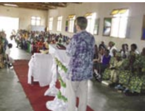
Leaving service at Chang'ombe