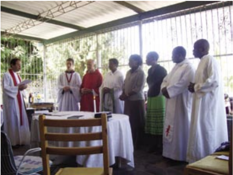
The first Trustees of Tariro