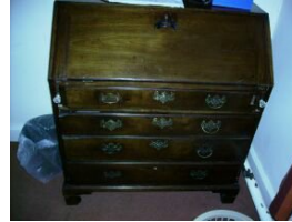
George II Bureau