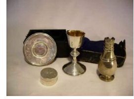
Silver Home Communion Set

(Photographs of five of the many items which will be included in the sale, all proceeds going towards the Centenary Church Appeal. More items are needed and collection can be arranged if necessary)