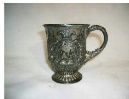
Silver Baptism Cup (1913)

(Photographs of five of the many items which will be included in the sale, all proceeds going towards the Centenary Church Appeal. More items are needed and collection can be arranged if necessary)